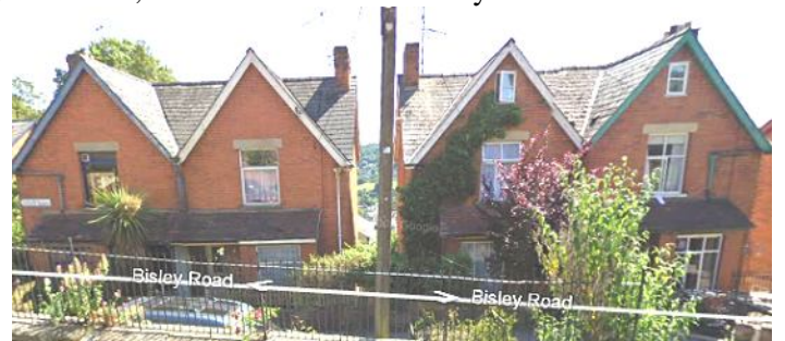
(here are Lypiatt Villas today, thanks to Google Street View)

Lots 56, 57 and 58 faced onto Bisley Road. No 62 Bisley Road (built on two-thirds of Lot 58) occupies the largest plot and the garden there once contained glasshouses and stables, and still has a separate lane to a back gate. The Deeds for No 102 Bisley Road – one of the block of houses built on Lot 56, later named Lypiatt Villas but first called Bristol and Leominster Villas – identified George HOLLOWAY, Gent, of Stroud, as the Vendor in a conveyance in 1884.